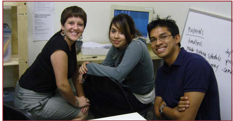
Your support will help us make a difference