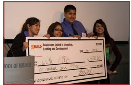
2007's winning team, Young Hype

Wondering who the next enthusiastic visionary, positive thinker, decision maker in Silicon Valley will be? Then mark your calendars and plan to attend BUILD's annual Business Plan Competition in May, 2008 hosted by the Stanford Graduate School of Busi-