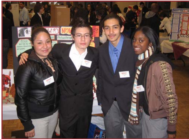
Student business team "Herstory Now"

Holiday Sales Bazaar in East Palo Alto. We sought to build a positive partnership with the brand new East Palo Alto YMCA so that we could house our annual event at their beautiful location. Even though space options are extremely limited in East Palo Alto for an event of this scale, we