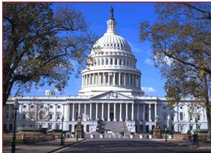
BUILD goes to Washington!

population. A closer look at DC's public high schools reveals that almost all schools are seriously under-performing, with between